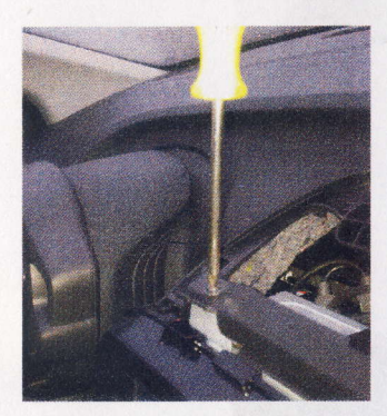
UNSCREW THE OEM METAL BRACKET

REMOVE THE OEM UNIT RADIO AND THE OEM DASHBOARD AS SHOW ON THE PICTURE